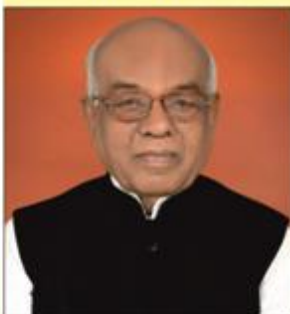
Shri Satyadeo Narain Arya, Hon'ble Governor-Chancellor CRS University, Jind

Chaudhary Ranbir Singh (CRS) University, Jind is a State Govt. University established by Govt. of Haryana in National Capital Region (2 hour journey from Delhi by Road/Train) invites online applications for admissions for various courses (Regular Mode) for the session 2020-21. Detailed informations are available on the university website : http://www.crsu.ac.in .